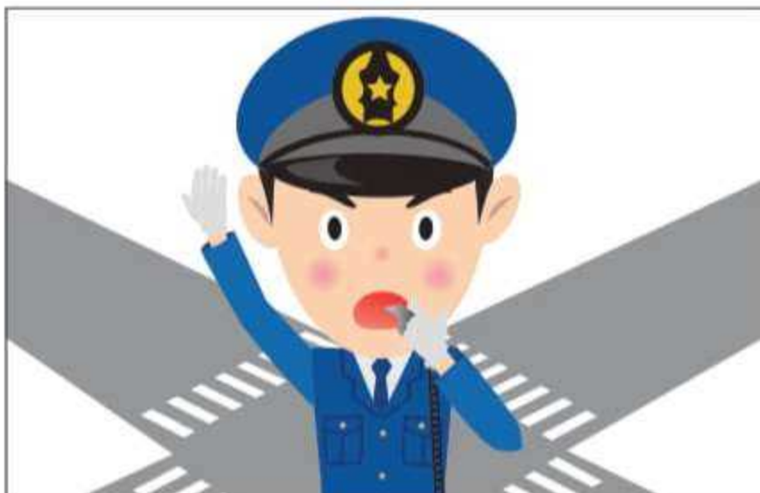
Follow the instructions of police officers, etc.