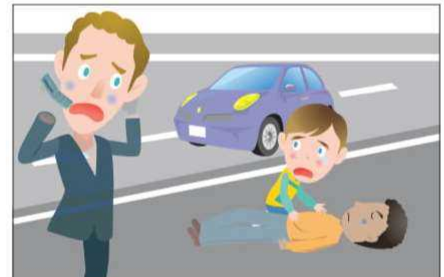
If you find someone in trouble in a traffic accident or vehicle failure, please cooperate with each other by calling emergency services or providing relief, etc.