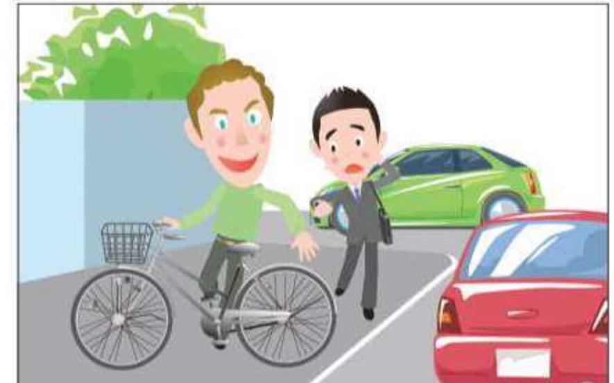
In order to avoid obstacles or nuisances for traffic, do not litter on a road or leave something without permission.