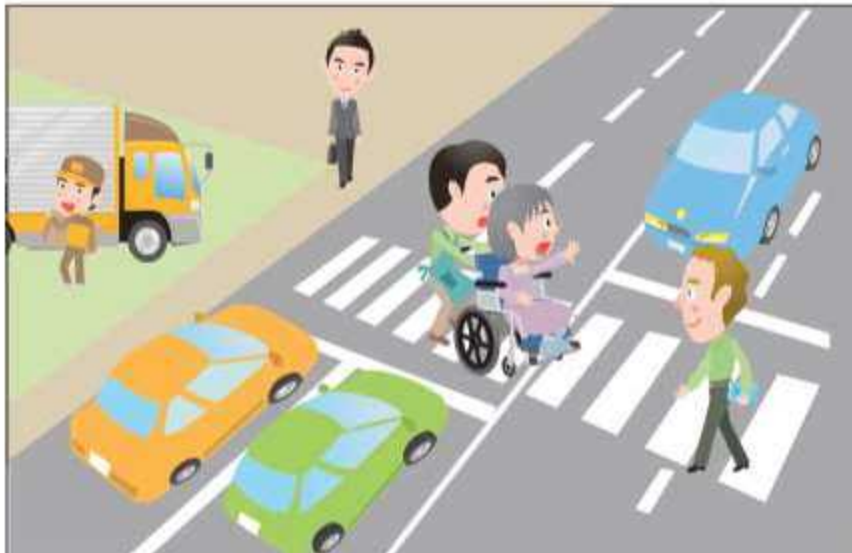
You need to be careful of the movements of surrounding pedestrians and vehicles, and act with consideration for others.

Many people and vehicles use the roads. It is an obligation for a member of society to follow traffic rules for securing safe and smooth traffic, and to practice good traffic manners.