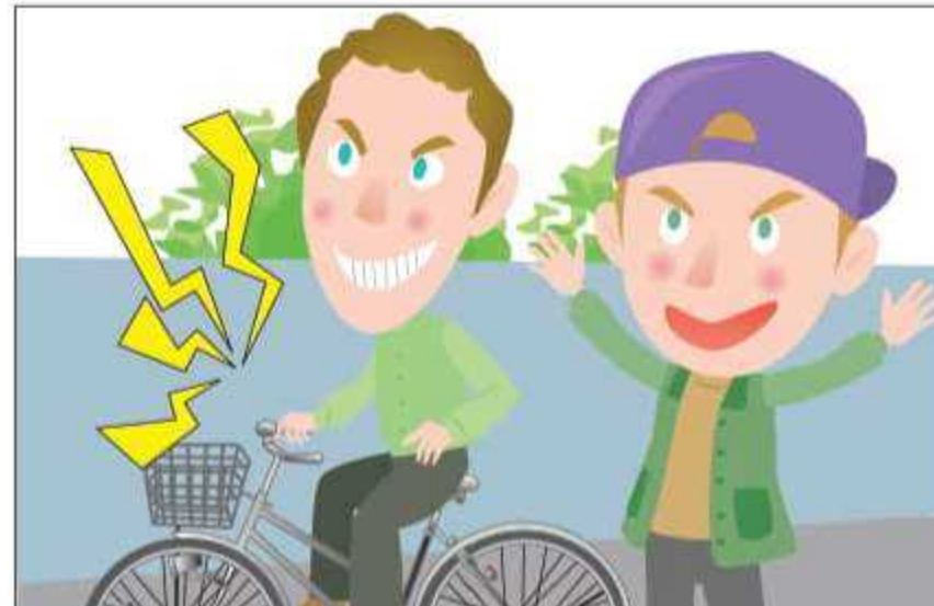
Think not just of your own convenience, and avoid making noise or other nuisances for people living along the road.